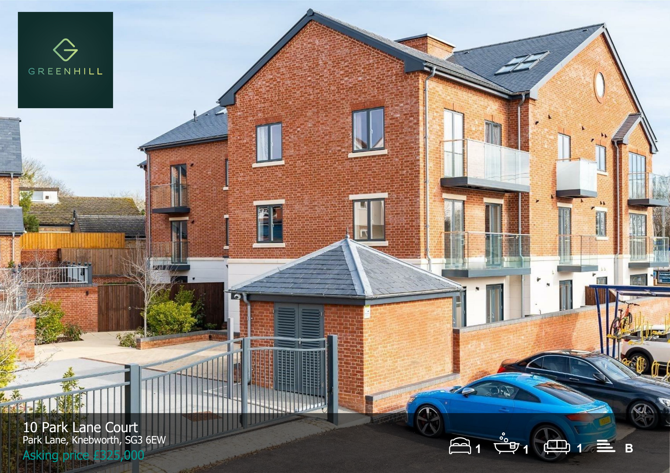
10 Park Lane Court Park Lane, Knebworth, SG3 6EW Asking price £325,000